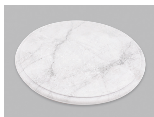
Marble Melamine Serving Platter