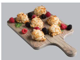
Melamine Serving Boards