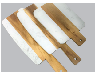
Marble and Acacia Wood Serving Boards