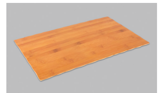
Wood-Look Melamine Serving Platter