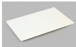
Rectangular Melamine Platter