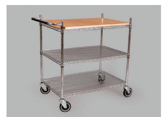
Interlock™ Display Cart